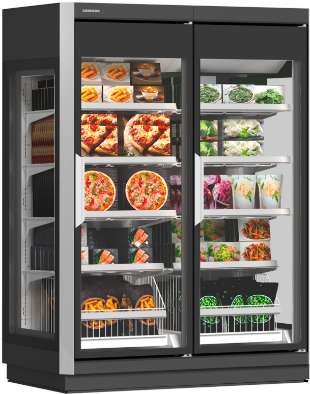
Illustration and equipment may vary.