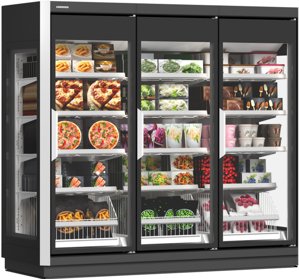
Illustration and equipment may vary.